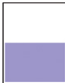
1/2 PAGE HORIZONTAL