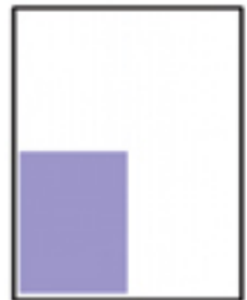
1/4 PAGE VERTICAL